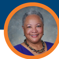
Marguerite White, Commissioner