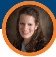
Rene Waldrop, Commissioner